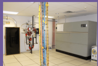
FIRE SUPPRESSION AND AN HVAC SYSTEM