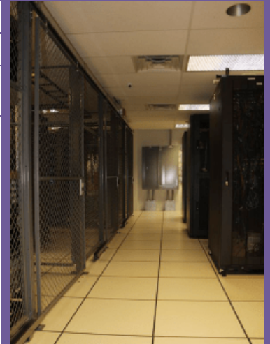
5NINES DATA CENTER