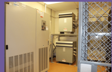
UNINTERRUPTIBLE POWER SUPPLY (UPS)